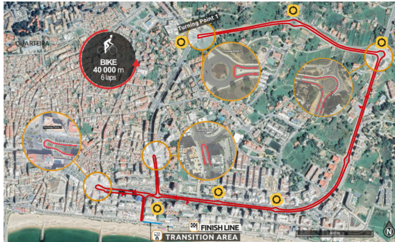
Elite - Bike Course Map

The cycling course at the Quarteira Triathlon European Cup is challenging, with 6 laps for the Elite category and 3 for Juniors. It covers coastal roads and urban areas, featuring 2 steep climbs that test competitors' technical skills and endurance. The multiple laps offer varied terrain, including tight turns and long stretches, demanding strategy, and resilience from athletes to tackle the demanding course with consistent pacing.