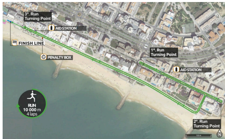
Elite - Run Course Map

In the elite category, the running segment consists of 4 laps along the flat and fast coastal boardwalk of Quarteira, while juniors cover 2 laps. This race unfolds against the backdrop of the scenic coastline, offering athletes a chance to complete multiple laps with minimal elevation changes. The elite competitors navigate four rounds, allowing them to leverage the smooth terrain for consistent pacing and speed, while juniors complete two laps, both experiencing the rapid and flat nature of this stunning course along Quarteira's coastline. Two aid stations will be available.