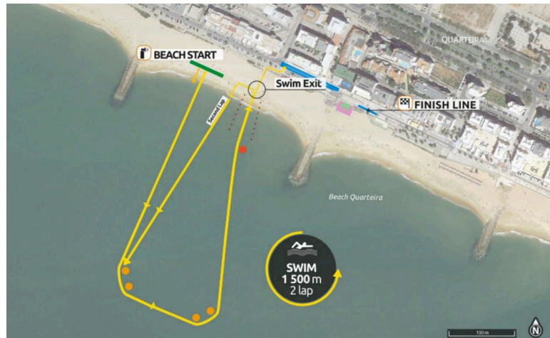
Elite - Swim Course Map