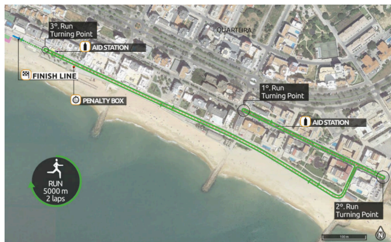
Junior - Run Course Map