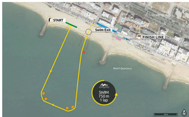
Junior- Swim Course Map